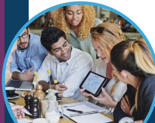
TABLE #15 FR Les résultats de recherche de qualité sur la PF et leur utilisation pour informer les politiques et programmes dans la région de l'Afrique de l'ouest